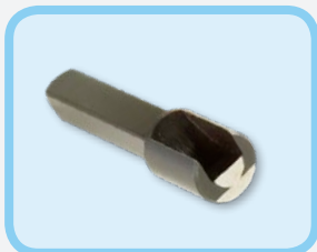
Single Point Scraping Tip