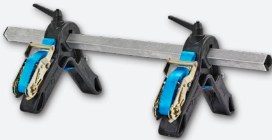
SC200 Strap Clamp