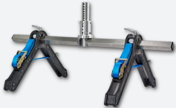
SC500 Strap Clamp with Angle Maker Knuckle

Caldertech Europe Bretfield Court, Dewsbury, West Yorkshire WF12 9BG, UK T: +44 (0)1924 469571 E: info@caldertech.com