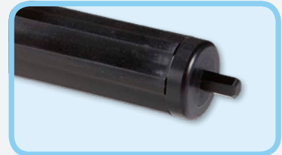
Power Drive Adapter